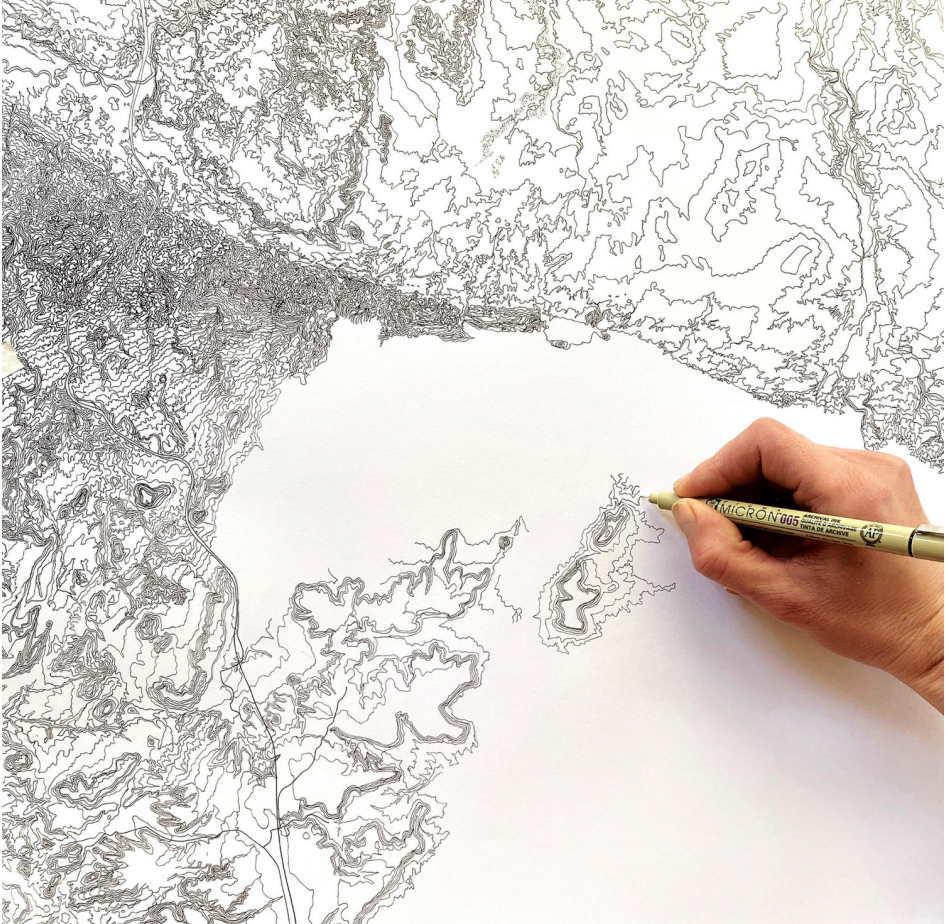
Kirsten Sparenborg, San Rafael Reef Drawing Process , 2021, photograph of artist's hand and ink on paper, 17" x 17"