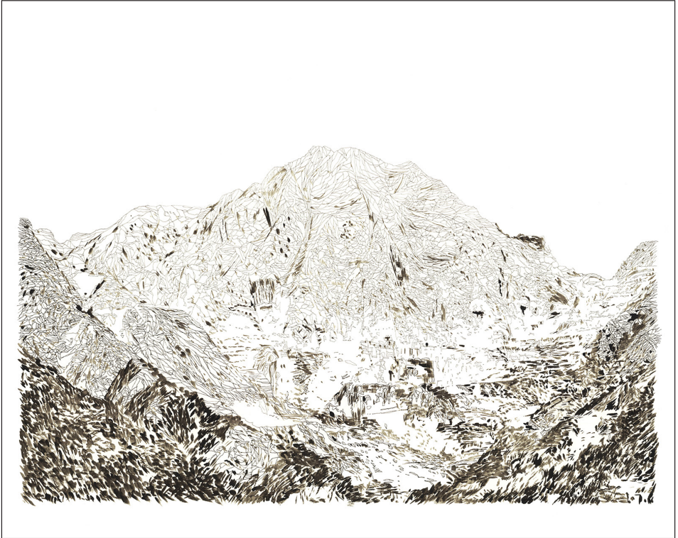
Kirsten Sparenborg, Carrara Marble Mine , 2020, watercolor and ink, 22" x 30"