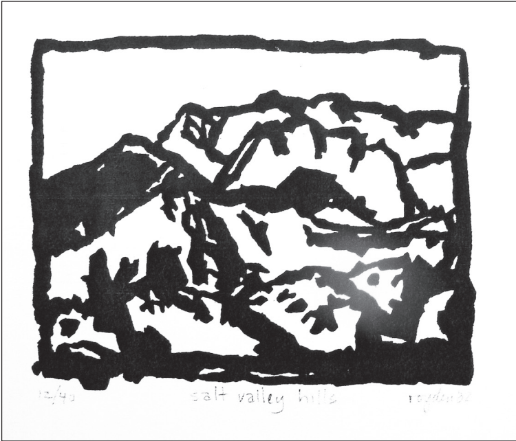
Royden Card Salt Valley Hills