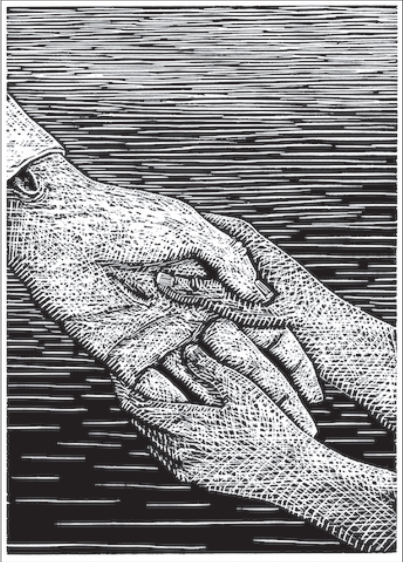
Witness © Brian Kershnik, 2018. Used with permission.